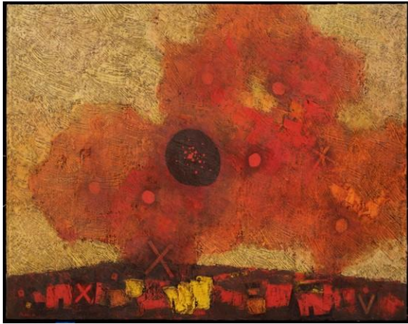
Fig. 2 - Landscape with Black Sun , by Mordecai Ardon (1961).

Ardon's use of color is significant, with dark and muted colors dominating the painting, further emphasizing the bleakness of the scene. One of the striking aspects of the painting is the way Ardon creates a sense of movement in the composition. The use of bold lines and curves creates a sense of flow, leading the viewer's eyes around the painting. The dynamic composition draws the viewer into the painting, making them feel like they are a part of the bleak landscape. Therefore, Landscape with Black Sun is an outstanding work of art that is thought-provoking and emotionally impactful. The painting's themes of darkness and emptiness may seem depressing, but Ardon's use of symbolism and dynamic composition make it a powerful and engaging work of art.