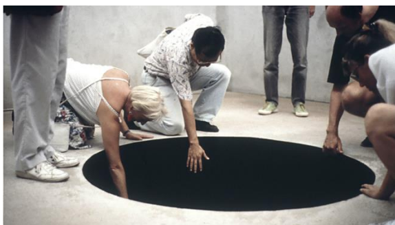
Fig. 3 - Descent Into Limbo , by Anish Kapoor (1992)

Ardon's use of color is significant, with dark and muted colors dominating the painting, further emphasizing the bleakness of the scene. One of the striking aspects of the painting is the way Ardon creates a sense of movement in the composition. The use of bold lines and curves creates a sense of flow, leading the viewer's eyes around the painting. The dynamic composition draws the viewer into the painting, making them feel like they are a part of the bleak landscape. Therefore, Landscape with Black Sun is an outstanding work of art that is thought-provoking and emotionally impactful. The painting's themes of darkness and emptiness may seem depressing, but Ardon's use of symbolism and dynamic composition make it a powerful and engaging work of art.